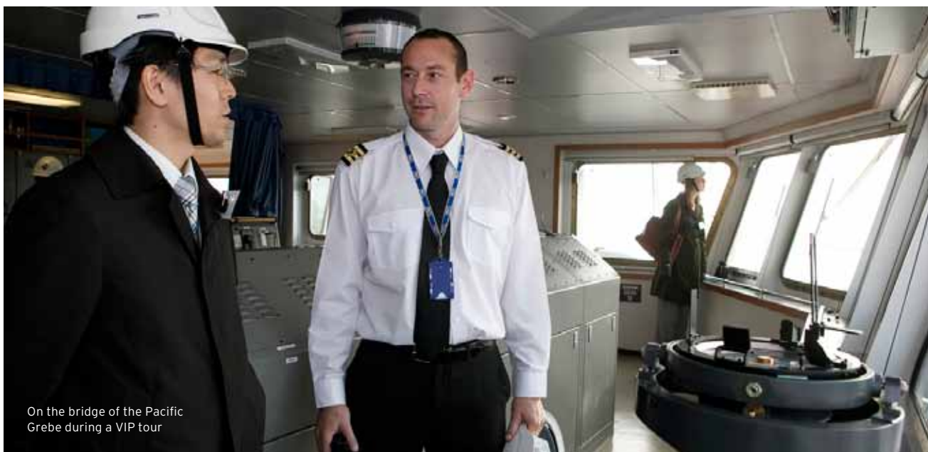
On the bridge of the Pacific Grebe during a VIP tour

In the unlikely event of a ship getting into difficulty, a fully trained and equipped team of marine and nuclear experts is available on a 24-hour emergency standby system, in line with IAEA requirements. The world's leading salvage experts, SMIT, are also contracted to support any unforeseen circumstances PNTL ships may face and the ships are equipped with a specialist system to assist in their location and subsequent salvage, should the unlikely need arise.